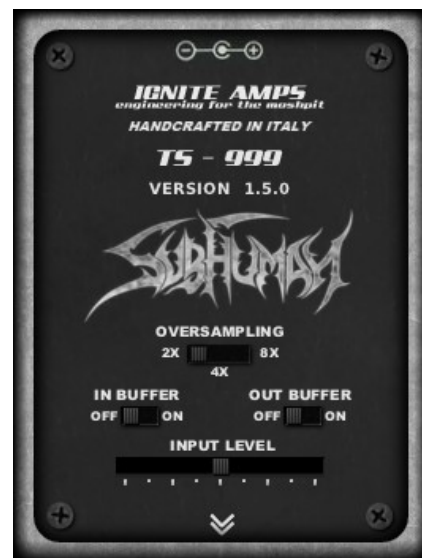
Fig. 3 – TS-999 Rear Panel