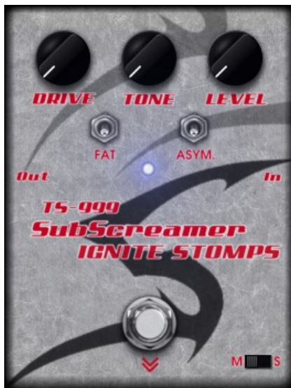
Fig. 2 – TS-999 Front Panel