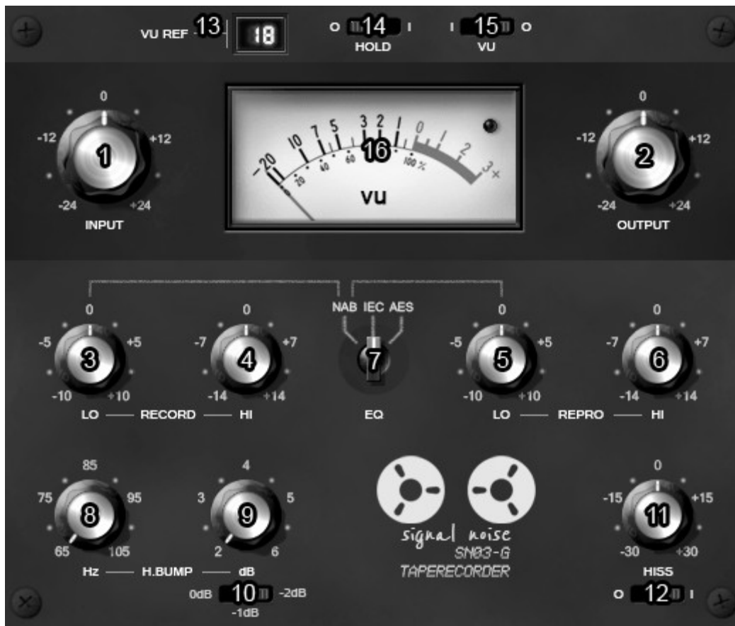
Figure 2. - GUI - default settings

Note: Percentage values in parentheses are default values meant for use with GUI-less version of the plug-in.